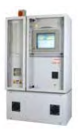
ACM 100 FT-IR