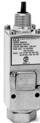
6900G & 6900P SHIPPING WT. APPROX. 13 OZ. (368 GRAMS)